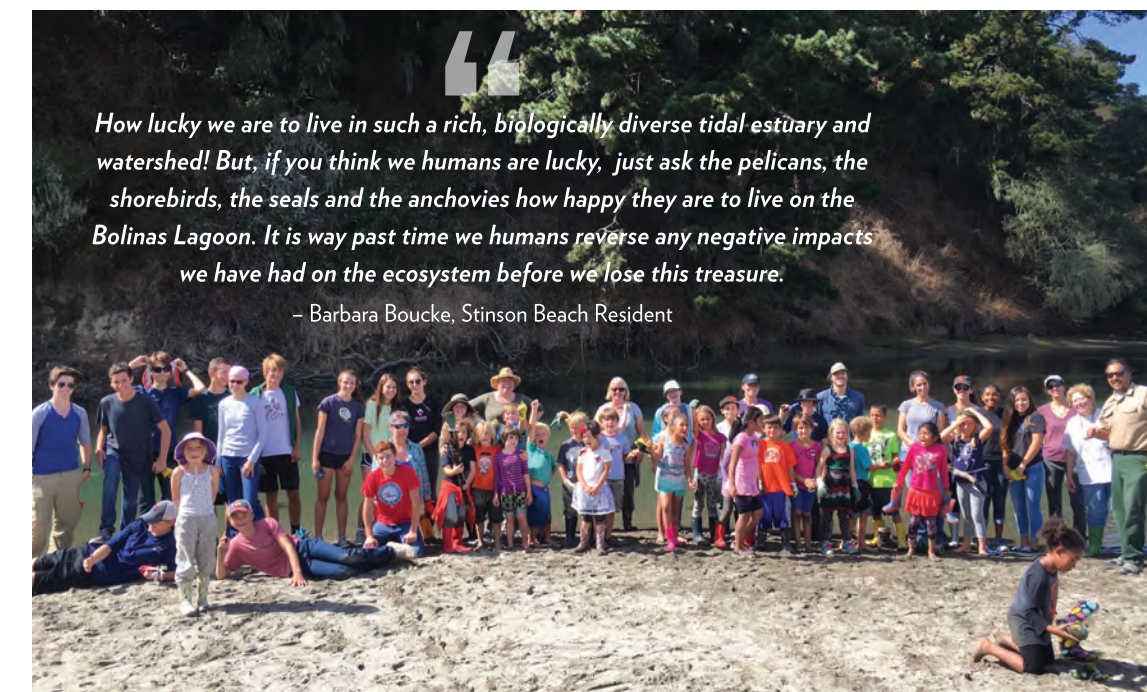
Community volunteers are continuing a long tradition of caring for Bolinas Lagoon by helping remove invasive species and restore native habitats on Kent Island.

Future climate change and sea level rise will further test these fragmented habitats and challenge both human and wildlife residents to find new ways to adapt and survive.