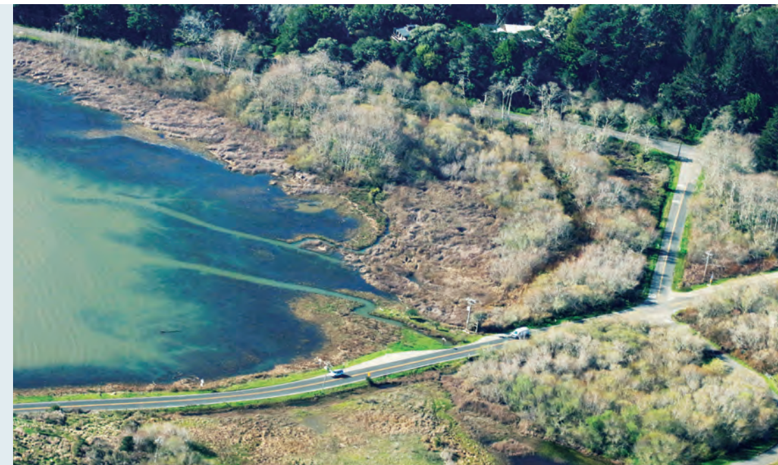
The Bolinas "Y" intersection at the north end of the lagoon is an example of how roadway development fragments habitats and prevents the lagoon from shifting in response to sea level rise.

Today, the Bolinas Lagoon Advisory Council, scientists, and the local community continue to support ongoing efforts to reverse past damage and ensure the lagoon's resiliency to future changes.