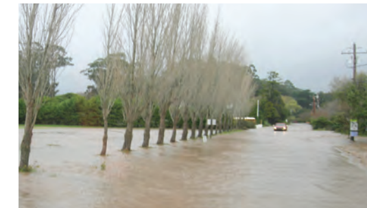
Without restoration, flooding on Olema-Bolinas Road will continue to worsen as sea levels rise.

Today, we are putting that vision into action and you can help! Residents, public agencies, local organizations, and other stakeholders are working together to restore habitats, protect wildlife, keep roads safe, and preserve the lagoon's stunning natural beauty. Numerous studies and ongoing monitoring of physical processes, habitat, and wildlife support these projects and help guide future planning.